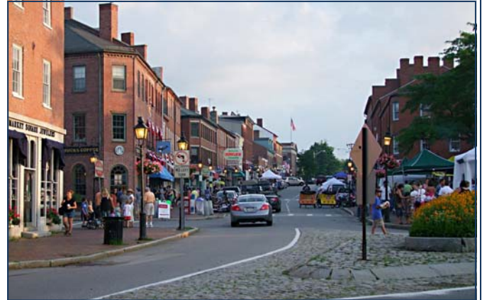
A thriving and complete Main Street in historic Newburyport, MA

Respond to community context and character.